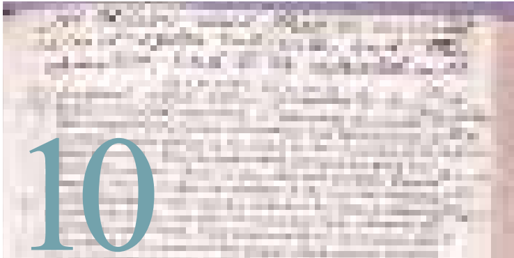
Mr Brontë's copy of Graham's Modern Domestic Medicine

Much of the good Patrick Brontë achieved during his long ministry at Haworth has been overshadowed by the fame of his daughters. Throughout Mr. Brontë's forty-one years in Haworth, his duties as a clergyman were wide-ranging, encompassing aspects